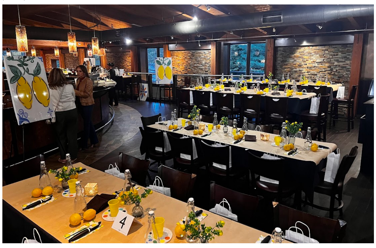
TRACKSIDE TERRACE 70 guests for a seated meal, 100 cocktail party

Rafters Lounge is a spacious area with an open floor plan on Rails upper level. It is perfect for larger and more casual events and parties. Your guests will be captivated by the beautiful two-story fireplace, the skylights and striking woodwork of the high ceiling and the unique catwalks which mirror the railroad tracks outside as they connect the lounge to other parts of the restaurant.