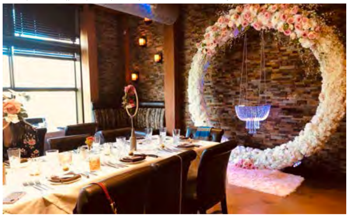
MAIN DINING ROOM 90 guests for a seated meal, 125 cocktail party

Natural light and open space during the day. Walls of candle-lit stacked stone, cozy tables, leather chairs and, of course, a book-lined wall help to create the warm, authentic ambiance in the Library. Floor-to-ceiling windows on one side of the room offer a picturesque view of downtown Towaco and Waughaw Mountain.