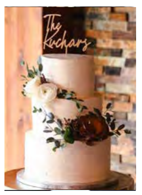
A classic rustic cake with no or lightly frosted & decorated with fresh flowers and a topper - provided by the party host.