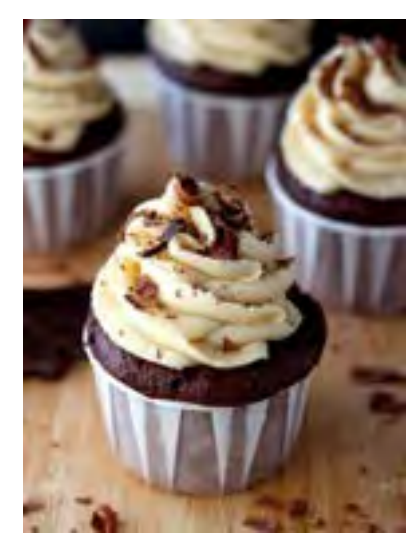
CUP CAKES $36 per dozen

Salted Caramel Mocha Chocolate Peanut Butter Caramel Rocky Road Chocolate Marshmallow Chocolate Guinness Stout